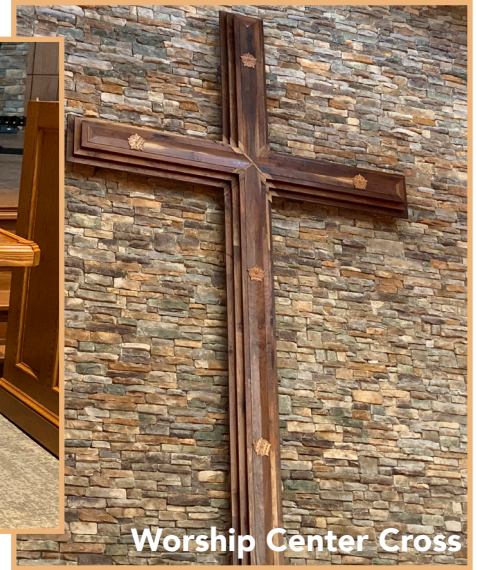
Worship Center Cross